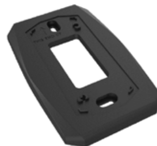
Part # 620-100230-001 Base Cover