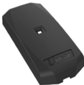
Part # 620-100229-001 Top Cover