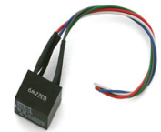
284 Form C Relay