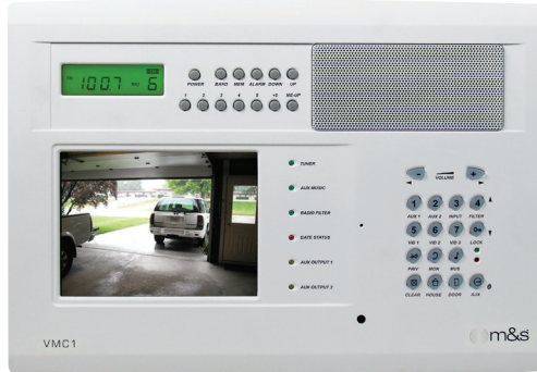
VMC1 Master Station