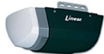
Garage Door Opener

The VMC1 Video Security Intercom system effectively displays the view of the garage door as it opens and remotely closes from any interior station. This Technical Bulletin provides wiring instructions on how to provide this solution with components from Linear connected to the VMC1 Master Station Control Output Switches.