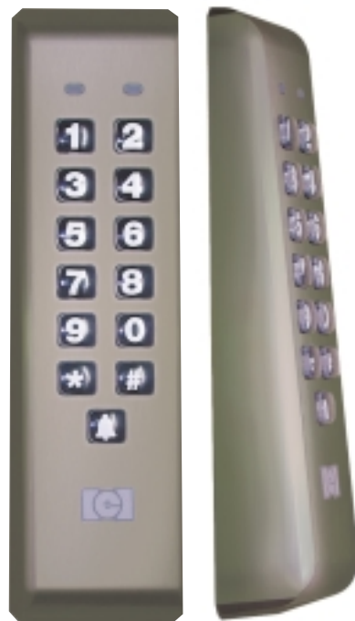
SSW-iLM™ Bronze Finish Mullion Keypad