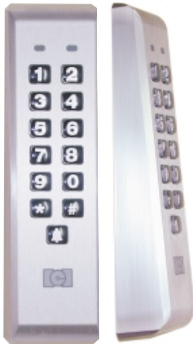
SSW-iLM™ Aluminum Finish Mullion Keypad